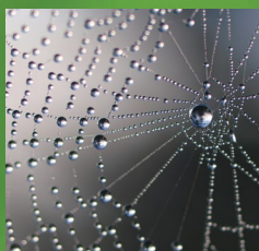
allegator RAINWATER SYSTEMS