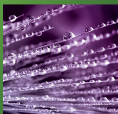
evolve FASCIA, SOFFIT & COPING