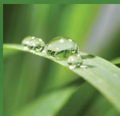
evolve RAINWATER SYSTEMS

Outlets are delivered to site packaged and ready for installation. Outlets should be stored on a flat level surface and protected from mechanical damage.