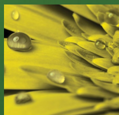
elite ROOF OUTLET SYSTEMS