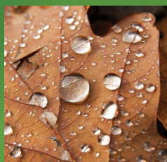
traditional RAINWATER SYSTEMS