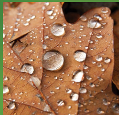
traditional RAINWATER SYSTEMS