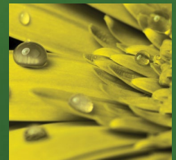
elite ROOF OUTLET SYSTEMS