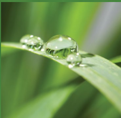
evolve RAINWATER SYSTEMS

The hoppers are supplied in protective polythene sleeving and components packed in cardboard boxes. If polyester powder coated products are stored outside, cover with tarpaulin to guard against water ingress. If water becomes trapped within the polythene wrapping and left exposed to warm sunlight, it may leave permanent water stains on the paint finish.