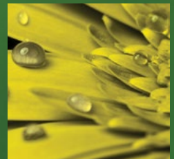
elite ROOF OUTLET SYSTEMS