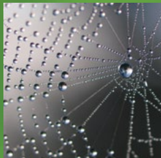
aligator RAINWATER SYSTEMS