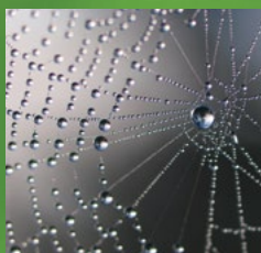
aligator RAINWATER SYSTEMS