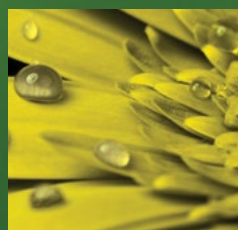
elite ROOF OUTLET SYSTEMS