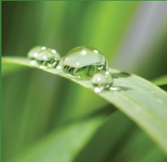
evolve RAINWATER SYSTEMS

All gutter and pipe lengths are supplied in protective polythene sleeving and components packed in cardboard boxes. If polyester powder coated products are stored outside, cover with tarpaulin to guard against water ingress. If water becomes trapped within the polythene wrapping and left exposed to warm sunlight, it may leave permanent water stains on the paint finish.