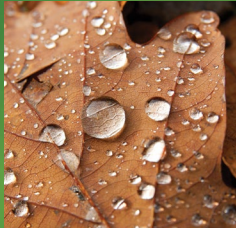
traditional RAINWATER SYSTEMS