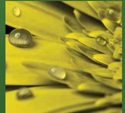
elite ROOF OUTLET SYSTEMS